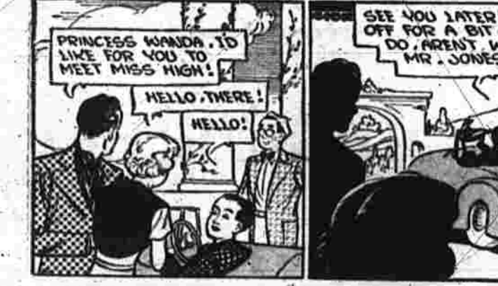
CAPTAIN EASY A Threat BY LESLIE TURNER