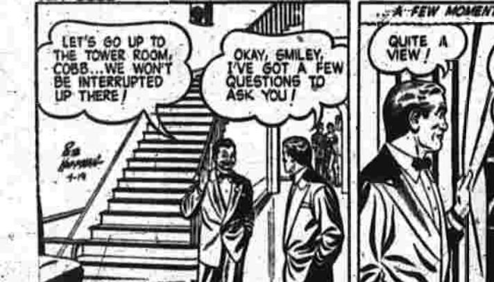
CAPTAIN EASY A Threat BY LESLIE TURNER