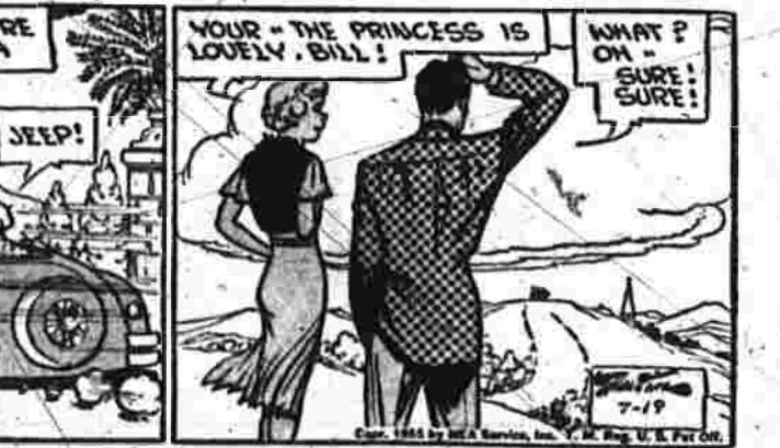
MICKY FINN Contact Delayed! BY LANK LEONARD