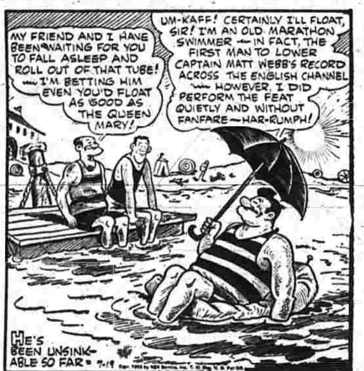
FLARE-UP BY V. T. HAMLIN