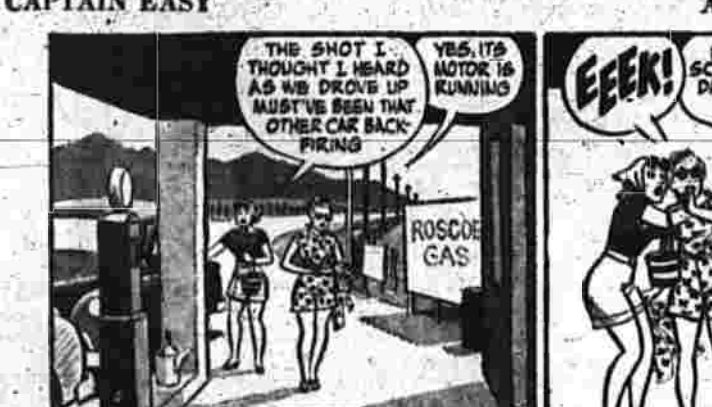
CAPTAIN EASY A Threat BY LESLIE TURNER