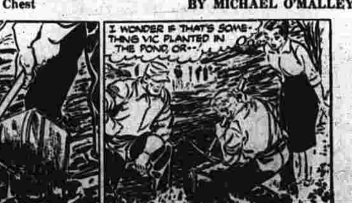
MICKY FINN Contact Delayed! BY LANK LEONARD