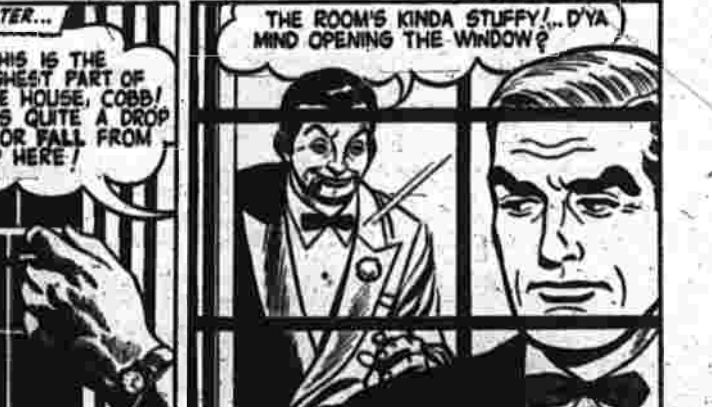
MICKY FINN Contact Delayed! BY LANK LEONARD